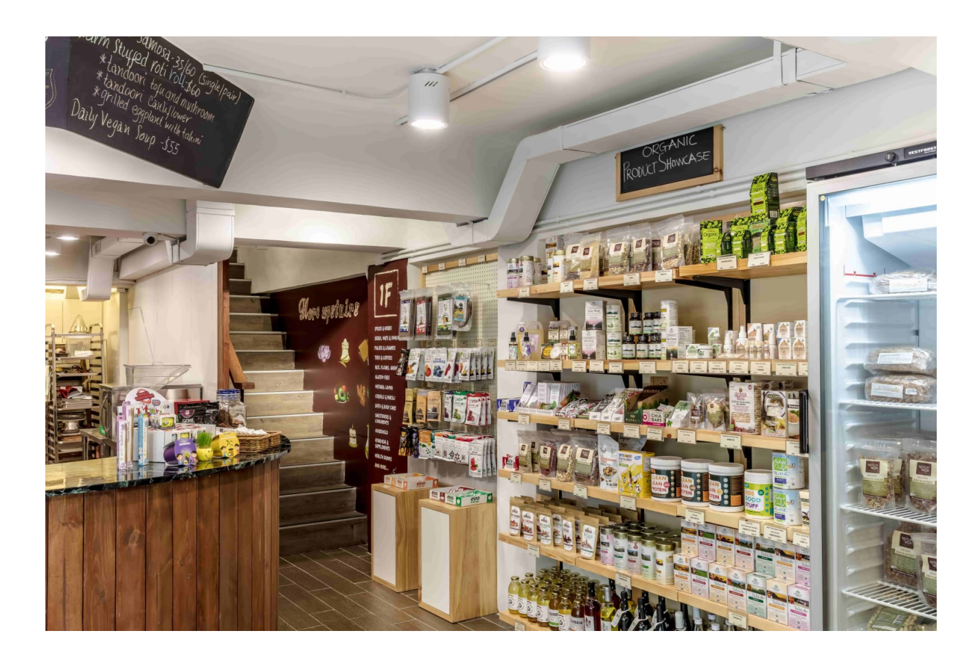
SpiceBox Organics and its selection of sustainable products - even beyond food

high-quality plant-based proteins, they ensure that every dish is packed with nutrients and bursting with flavor. Their dedication to providing chemical-free and sustainable ingredients extends to their catering services, ensuring that customers can enjoy hearty, delicious meals without compromising their health or