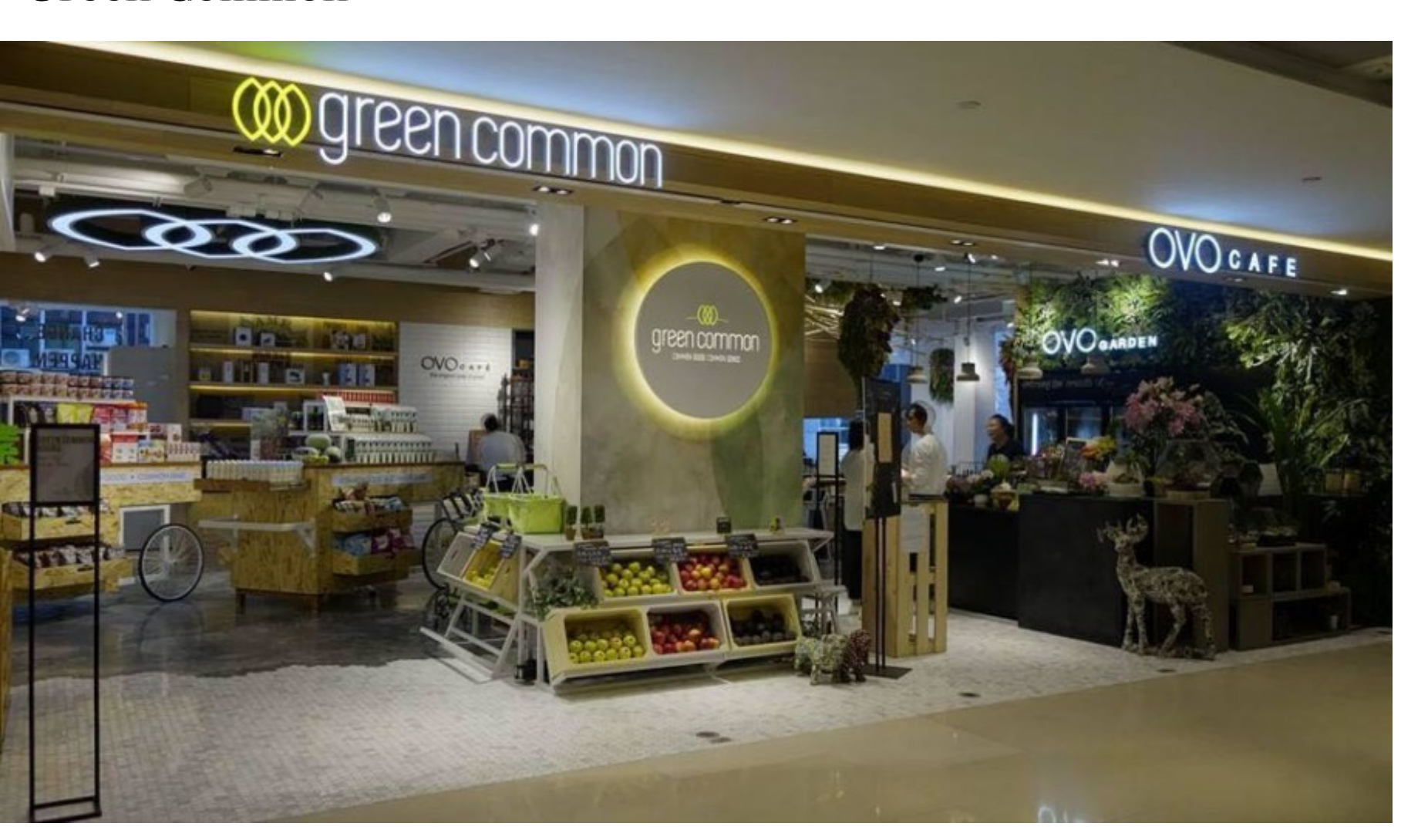
Get shopping at Green Common for all your vegan, sugar-free and gluten-free ingredients

Since 2012, social enterprise Green Monday has been dedicated to promoting veganism, vegetarianism and healthy eating in Hong Kong and they opened their first plant-based concept store Green Common at Nan Fun Place. With branches across the city, stop by to browse the shelves for the latest international products, including gluten-free and sugar-free lines, or pick up an array of substitute meats and dairy products from companies like Beyond Meat, Gardin and Daiya. It's the best place to get your vegan sausages and yogurt cups. AND you can sit down for a taste of the impressive Beyond Burger at their restaurant/deli section.