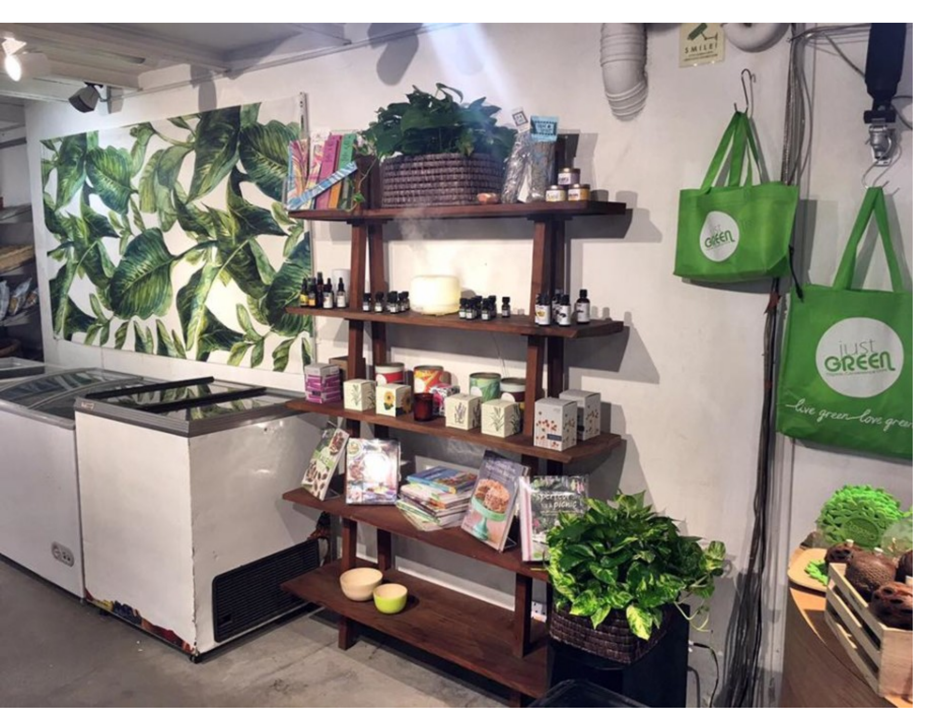
JustGreen is a welcoming organic grocery store that attracts vegans, vegetarians and health-conscious omnivores