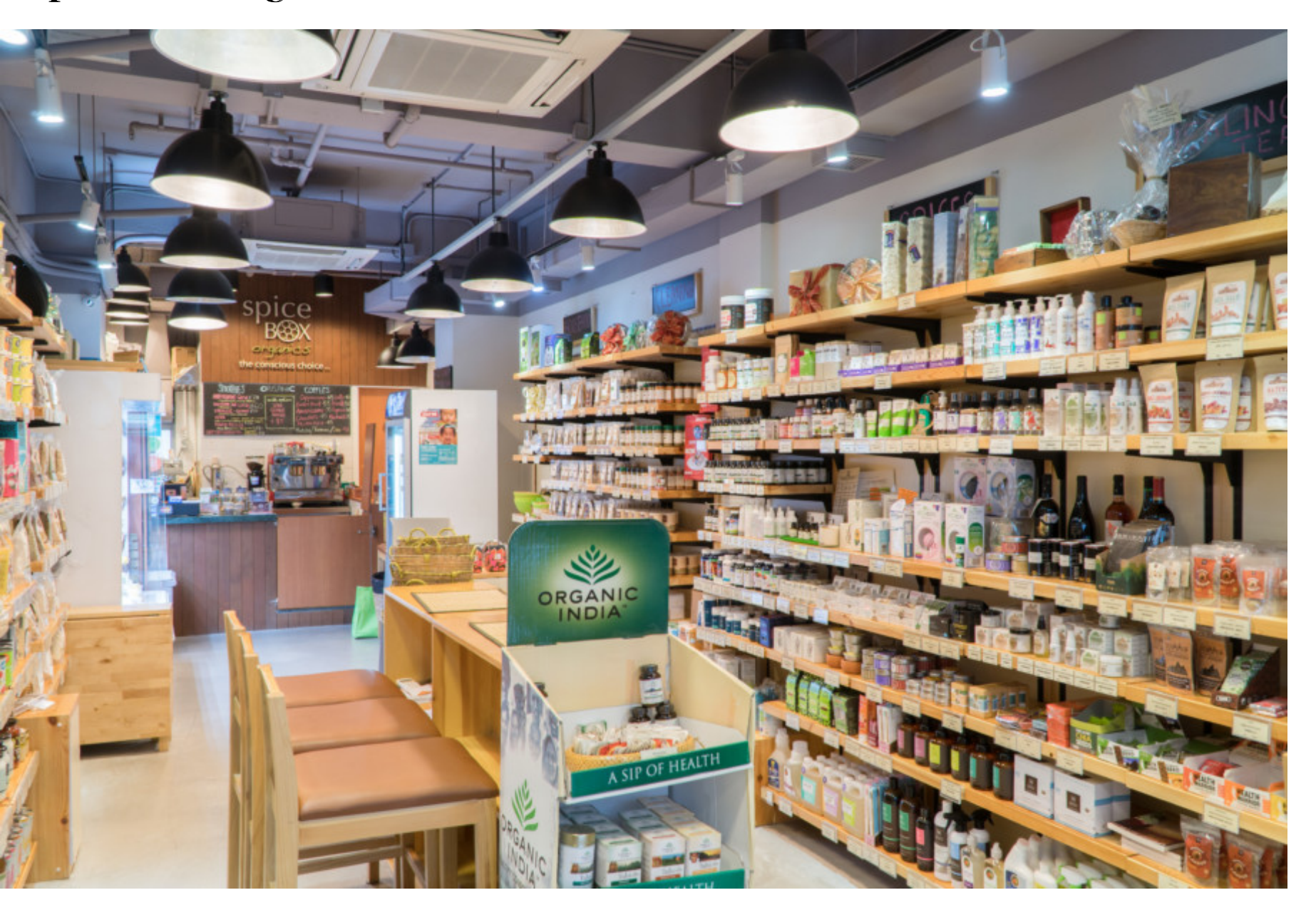
Stock up on tasty spices and array of hand-selected products for your well-being at SpiceBox Organics

SpiceBox Organics is a cosy health food store and deli with branches across Hong Kong selling an extensive range of superfoods and health products that fulfills the needs of your plant-based pantry. As the name suggests, they are big on spices, so this is a good place to hit if your local supermarket is lacking what you need. They also provide different vegan and vegetarian lunch meals such as vegetarian lasagne, baked samosas, vegan brownies for customers to take away.