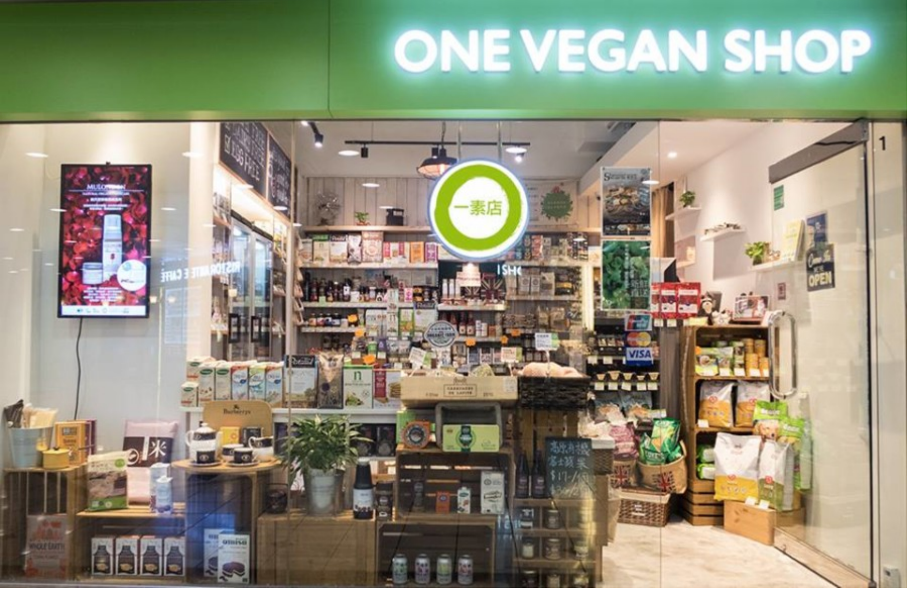
One Vegan Shop is the ultimate destination for vegans

One Vegan Shop is a neighbourly vegan grocery store that offers a wide selection of cruelty-free essentials, including beauty products, pet food and grooming products. Having sourced different snacks and home products directly imported from the USA, United Kingdom and European countries, this convenience store is a life-saver in New Territories area for health-conscious consumers and pet owners.