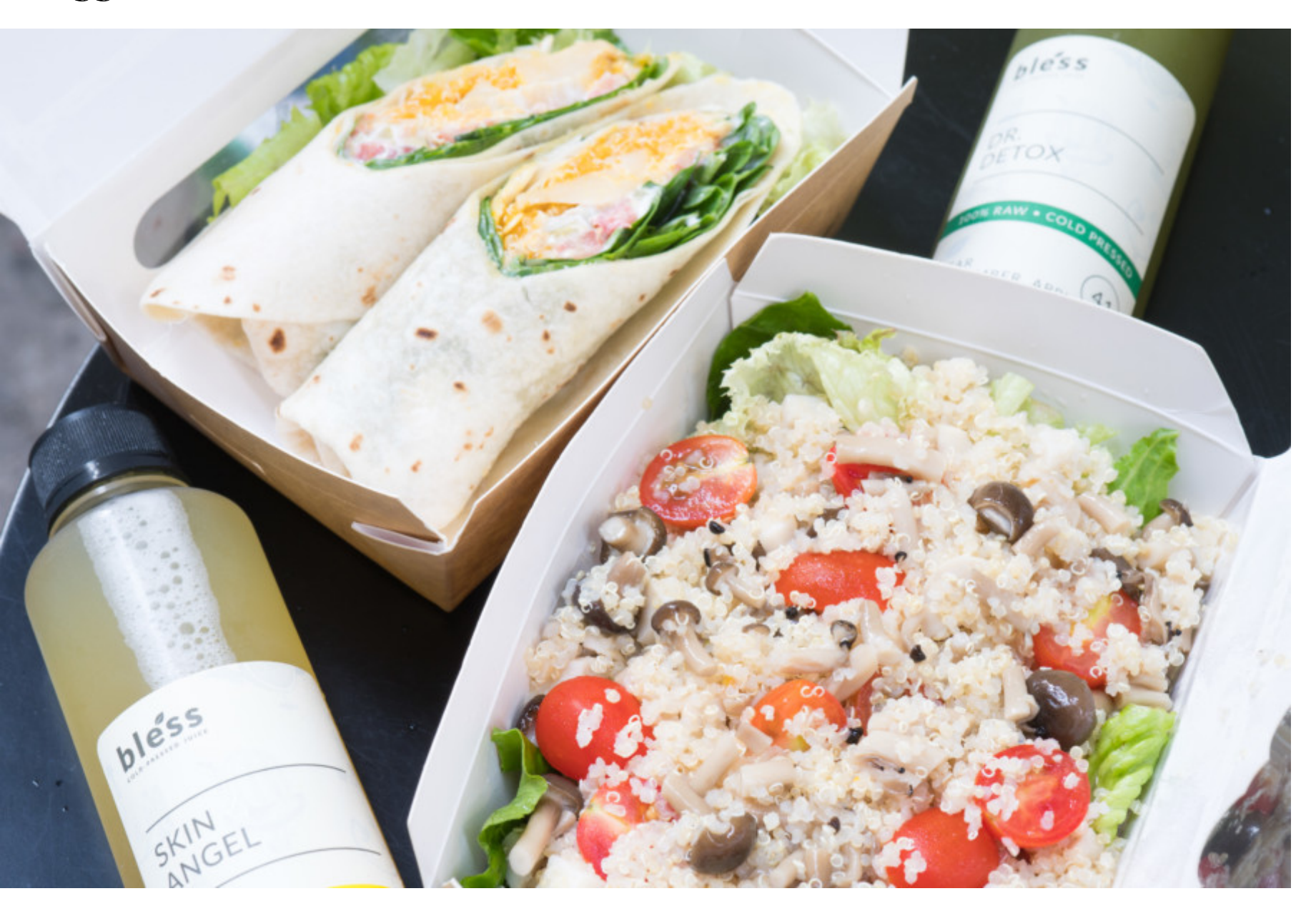
The quinoa and mushroom salad from Veggie Monster is zesty and satisfying

Veggi Monster is a rising vegan burger joint in Sheung Wan. Even though their burgers and wraps get most of press, their healthy and affordable salad boxes also deserve some recognition. Their salad menu varies every week, but look out for their fusilli salad with pumpkin sauce; it's divine!