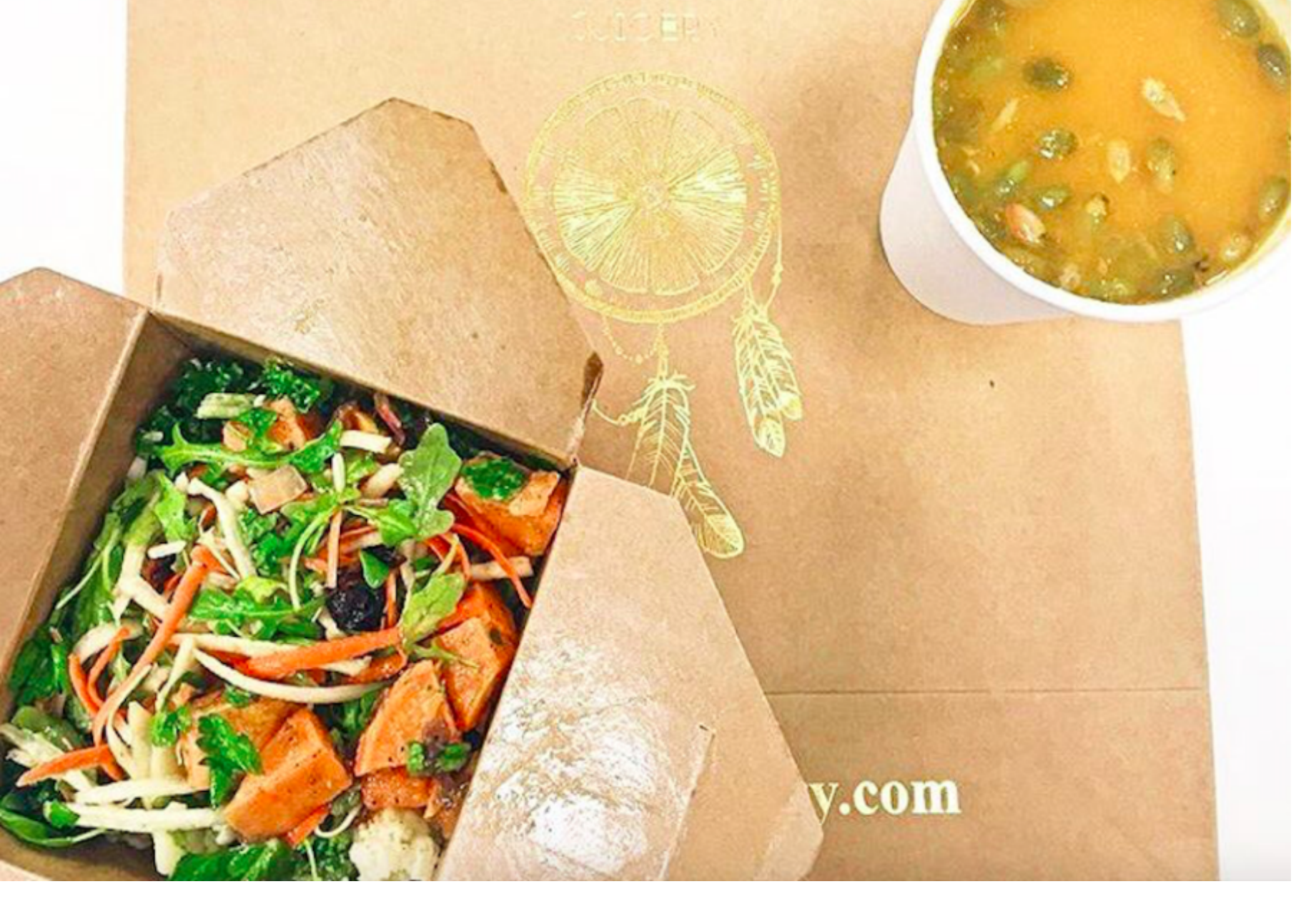
The salad from Catch Juicery follows the principle of clean eating and uses minimal oil

Catch Juicery is a vegetarian salad and juice bar located in the heart of Central. They're most known for their tasty cold-pressed juice, as well as their refreshing and healthy salads such as kale and roasted sweet potatoes, and raw cakes with avocado and lime flavours. You can eat as much as you want without feeling guilty. It's a great location to kickstart your clean eating habit!