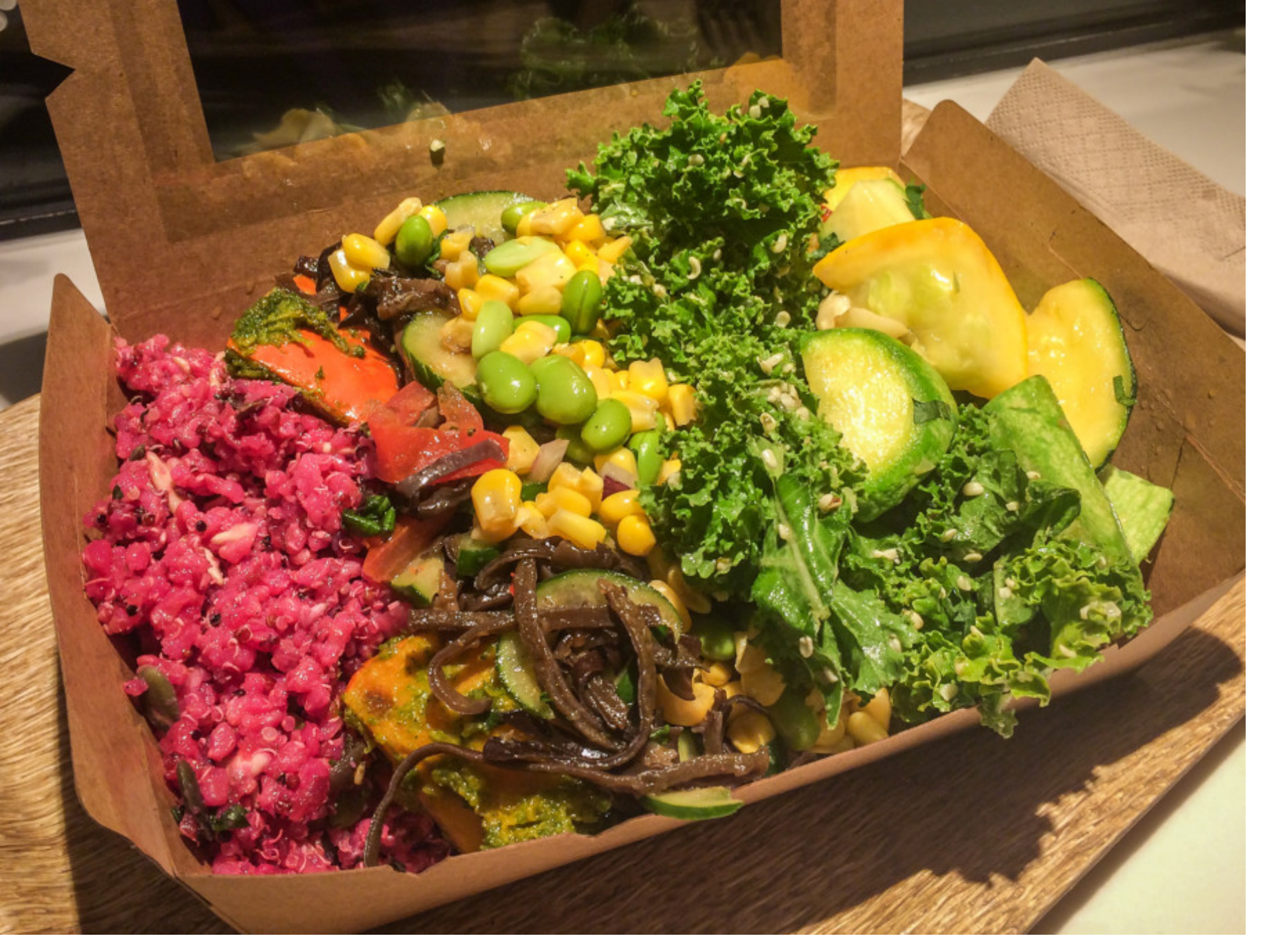
The colourful salad at Nood Food is packed full of flavours

Nood Food is located at Pure Yoga or Pure Fitness. You will find a diverse range of cold and warm salad upon entering the brightly-lit cafe, from vegetarian mixed beans and roasted pumpkins with pesto to tender chicken pieces and eggs. Their salad is nicely seasoned but not too over the top, making sure you can still taste the ingredients while getting enough flavours. Our favourite is their cold beetroot quinoa salad and warm roasted potatoes with garlic.