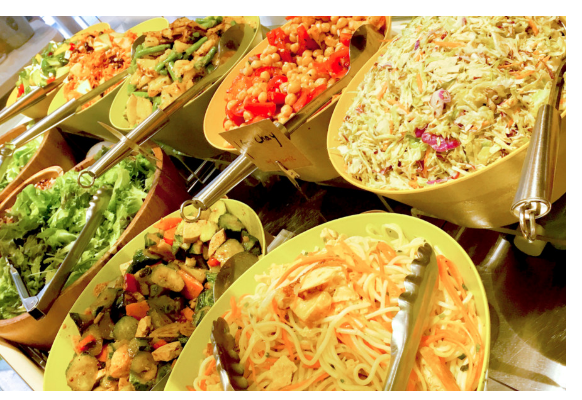
Fresca has over 10 salad options available and the menu varies daily

Fresca is a welcoming vegetarian cafe located in the heart of SoHo, Central and they're known for their generous portion sizes. They serve an amazing array of cold and warm salad, and their Goi Chay – aka Vietnamese vegetarian noodle salad – is mouthwatering. If you're into healthy sweets, give their glutenfree steamed muffins a try! You'll get a taste of neighbourly love in Fresca that can't be found anywhere else.