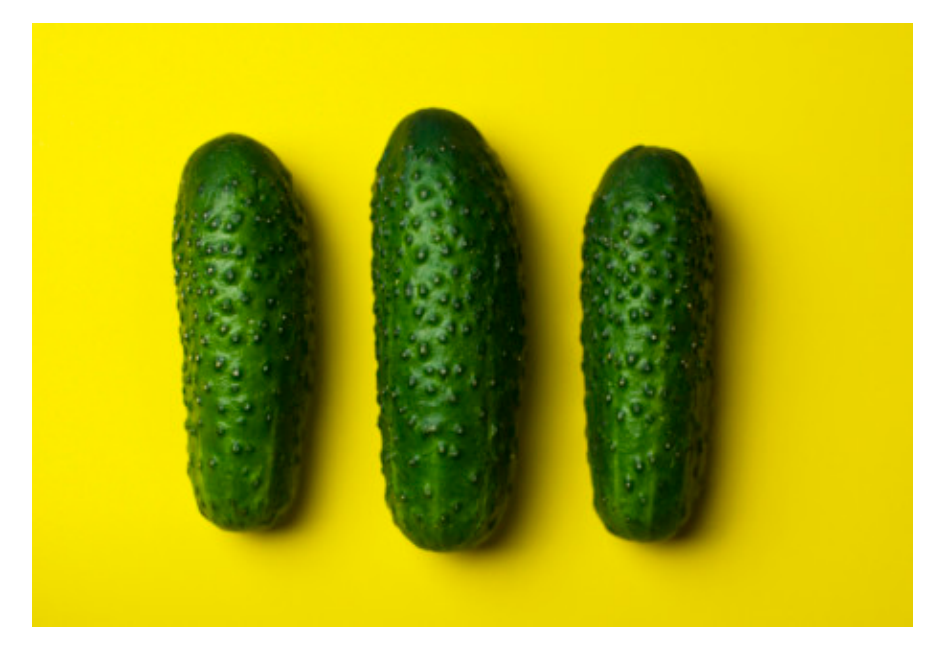
Our top tips for being vegan in Hong Kong