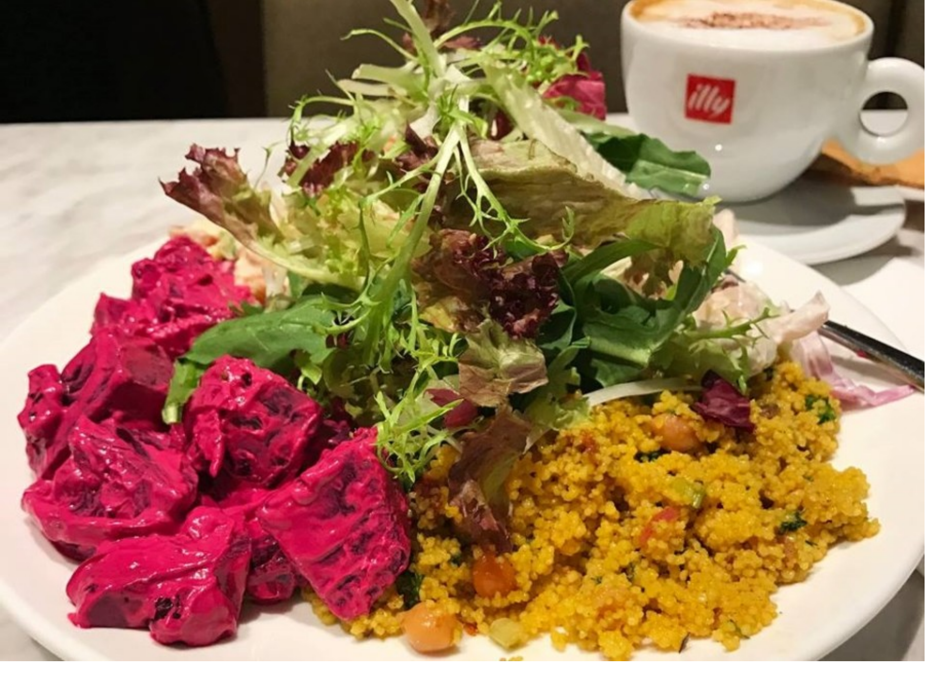
The couscous and beetroot salad at Passion by Gerard Dubois is delicious

Passion by Gerard Dubois is a traditional French cafe in Wan Chai. Their salad has gained a huge fan following, including omnivores and vegetarians. Also serving a myriad of grilled sandwiches, confectionery and French pastries, the cosy environment is perfect for friends to catch up, or for college students to catch up with their uni work.