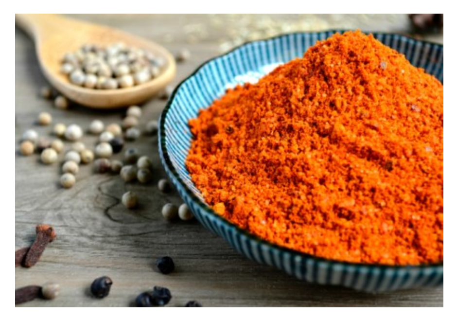
Stock your shelves at these health food stores